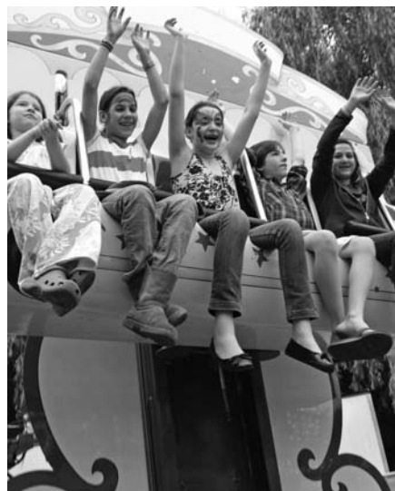
Children and adults enjoy a summer evening of fun and entertainment at Carnival Night for Kids.