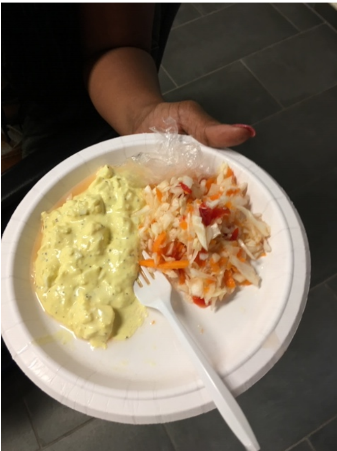
Casa de Carino