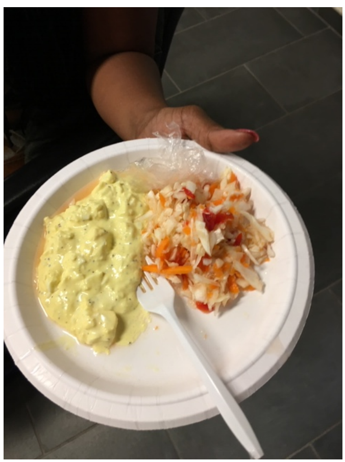
Casa de Carino